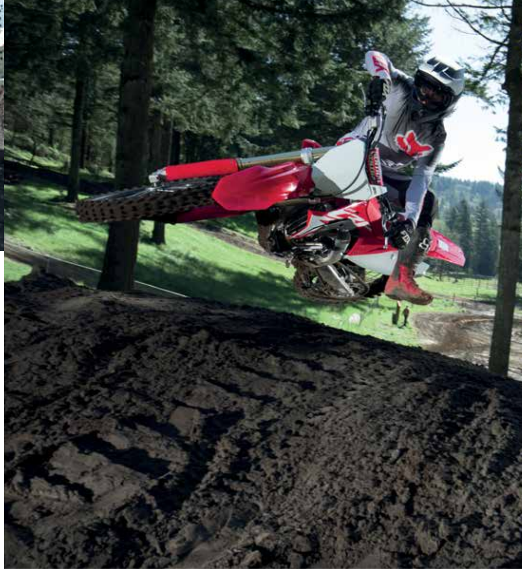
Discover more at: www.honda.be – www.honda.nl – www.honda.lu