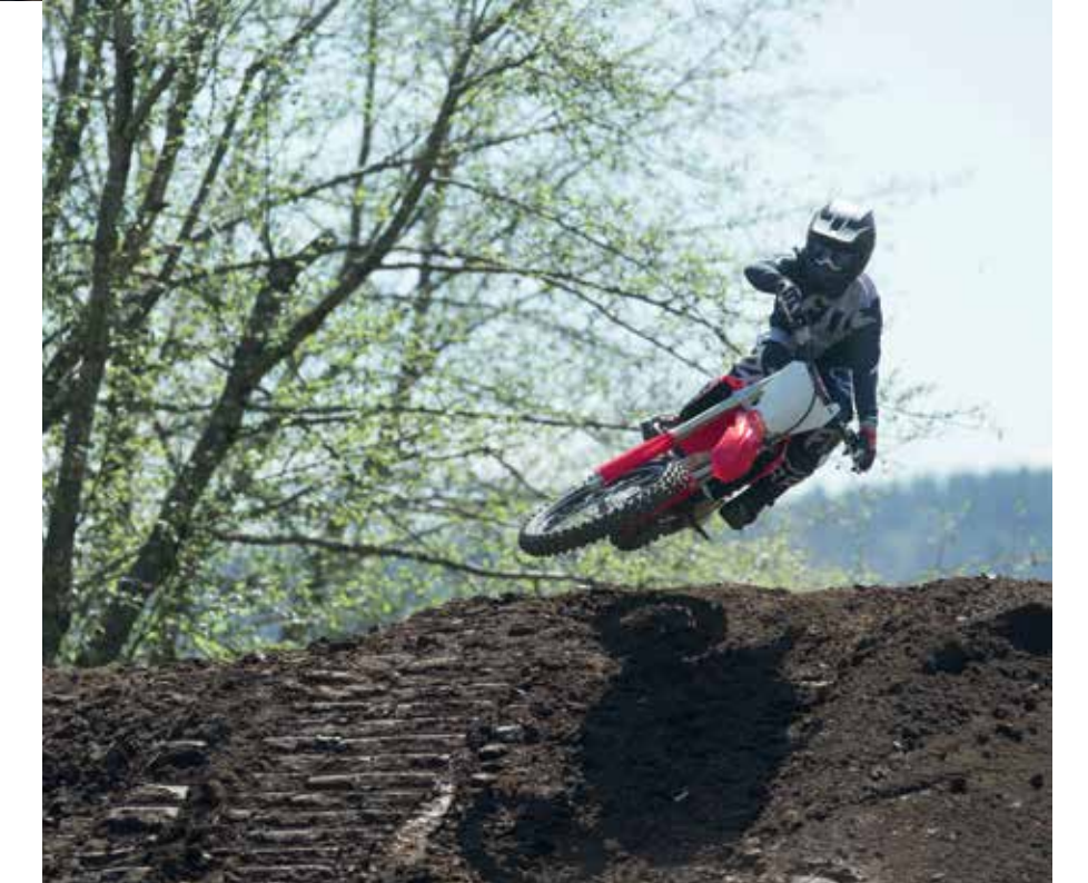
Discover more at: www.honda.be – www.honda.lu